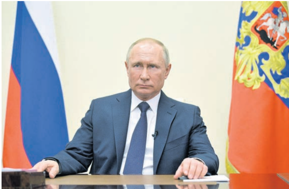
Russian President Vladimir Putin addresses Russian citizens on the State Television channels at the Novo-Ogaryovo residence outside Moscow, Russia, Thursday, April 2, 2020. Putin has ordered most Russians to stay off work until the end of the month to curb the spread of the coronavirus. Speaking in a televised address to the nation on Thursday, Putin said he was extending the non-working policy he ordered earlier for this week to remain in force throughout April.